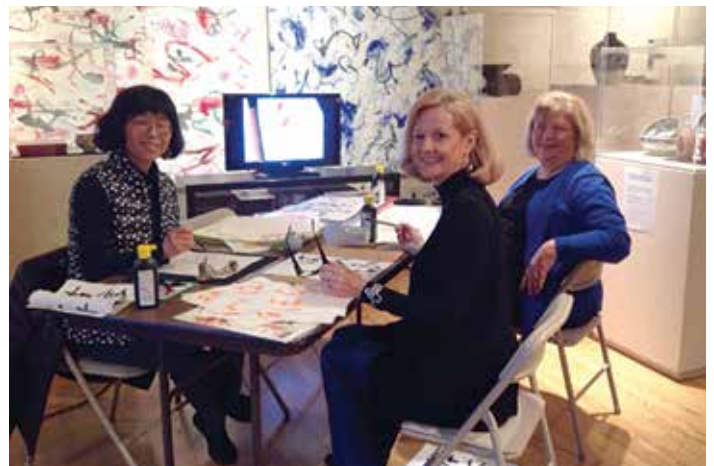
Calligraphy class held via YouTube (using modern technology to study traditional Japanese culture) on Wednesday nights

Another aspect of her profession was working on the Manresa publication, Manresa: An Edible Reflection .