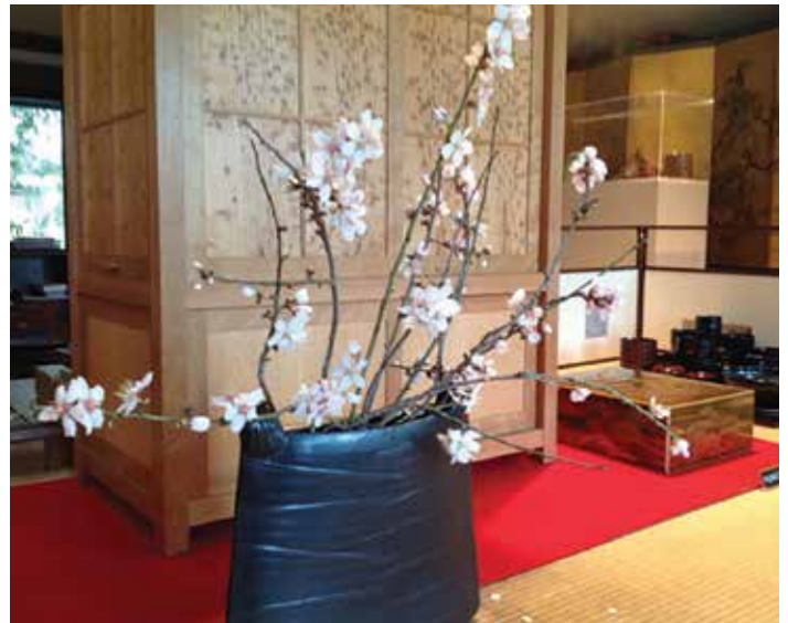
Deep appreciation of the seasons has immeasurable significance in Japanese culture. The cherry blossoms on display for the season are pictured in a contemporary vase. In Japan, cherry blossoms symbolize the transience of life, which is a major theme in Buddhism. The cherry blossom tree is known for its short but brilliant blooming season, a natural process that metaphorically describes human life.