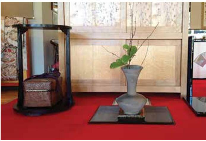
The ancient vase, Sueki 須恵器 on display with flowers from the backyard garden of Iwasawa. Sueki period: 7th century AD.