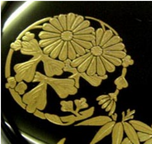
Hira Makie (flat makie)

a technique for which a painted design is applied at the time of the middle lacquer, on top of which urushi is layered. Then the entire surface is polished so that the painted design floats into view. Said to be the origin of makie.